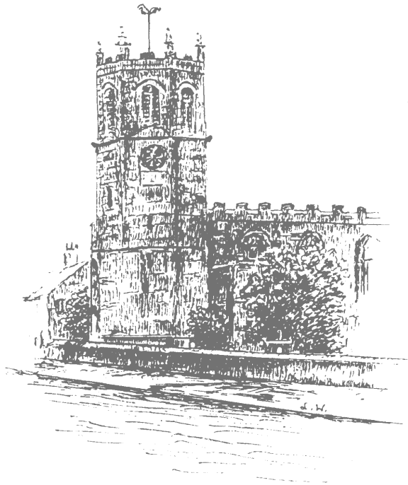
The current building dates largely from 1513 and 1889 with other renovations in 1817 and 2013-2015

Since 1280 this site has been a holy place for worship and prayer, and we encourage you to offer a prayer while you are here – for world peace, for the unity the church, for your own needs, and for the needs of others, giving thanks for many blessings, and for all who have gone before.